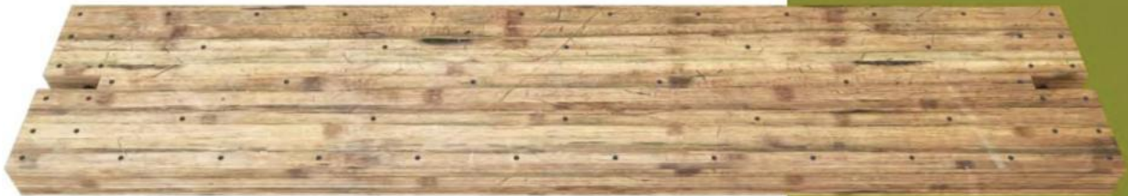
HORIZONTAL LAMINATED BAMBOO LAYERS